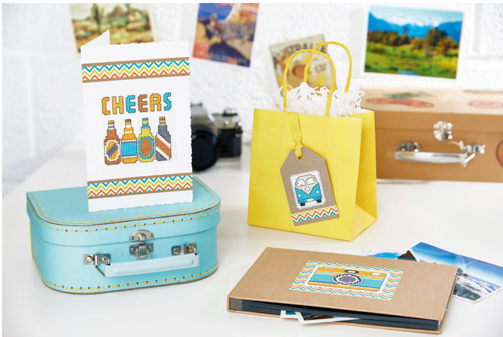
Father's Day motifs by Lucie Heaton