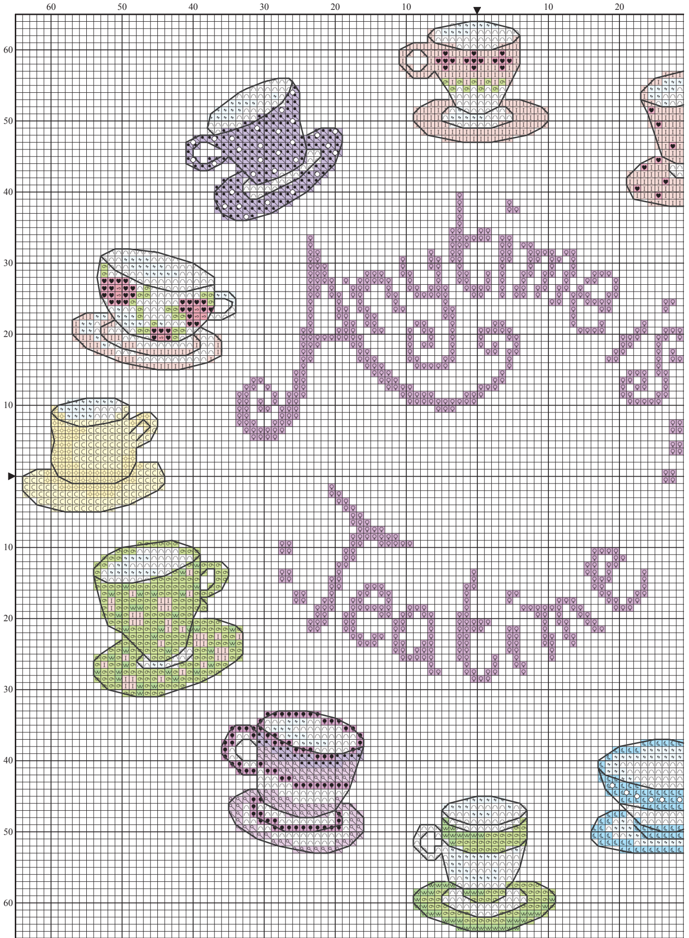
Teatime clock (left)